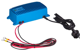
Blue Smart IP67 Charger 12/25