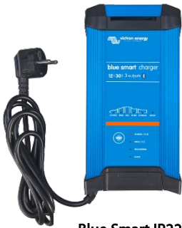
Blue Smart IP22 12/30 (3)