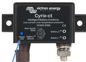
LED status indicator