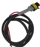
Control cable for Cyrix-ct 12/24-230 Length: 1 m