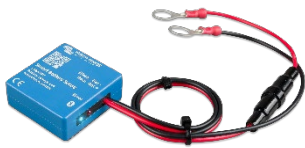
Smart Battery Sense Enables temperature and voltage compensated charging.