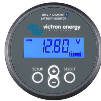
BMV-712 Smart Battery Monitor