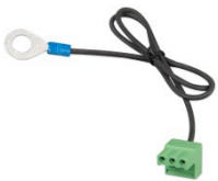
Connector with preassembled DC minus cable (included)

The BatteryProtect disconnects the battery from non essential loads before it is completely discharged (which would damage the battery) or before it has insufficient power left to crank the engine.