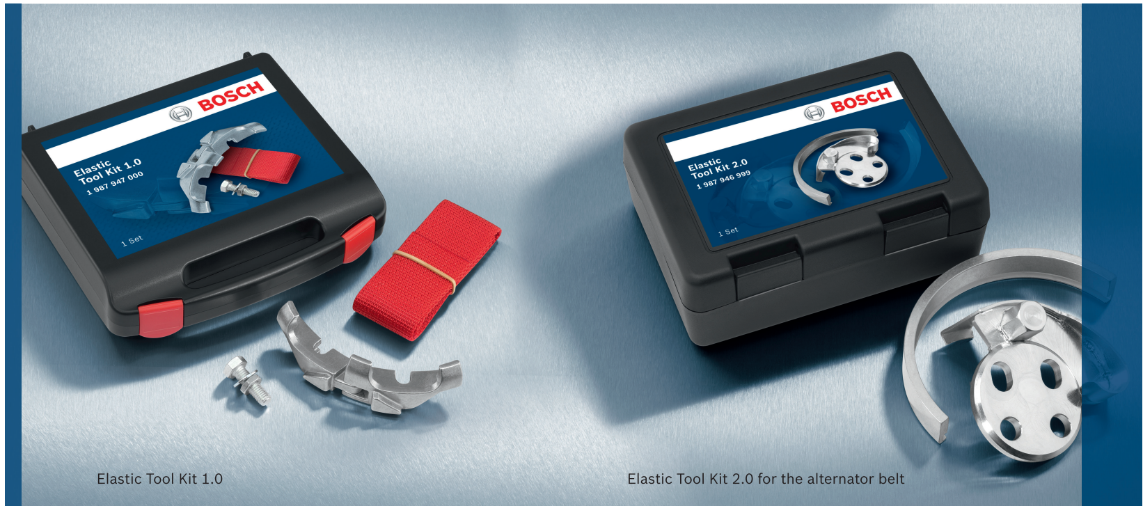
Elastic Tool Kit 1.0

Quick replacement – only with the universal tool