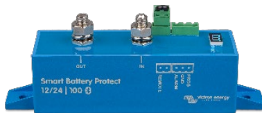
Smart BatteryProtect BP-100